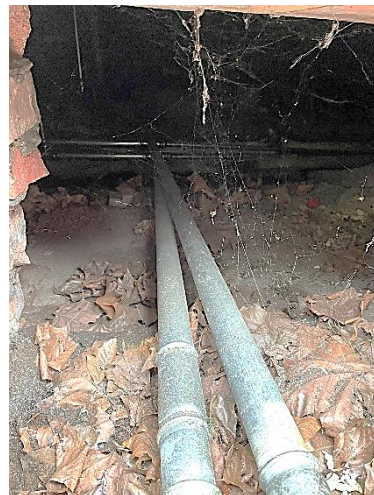
Pipework Running Within the Undercroft

Access to the external distribution pipework is satisfactory. Where pipework is above ground it is in either the enclosed riser sections, that have doors on, or within metal clad external boxing.