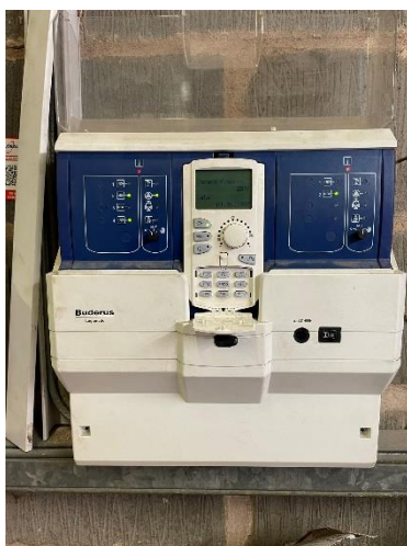
Existing Boiler Controller