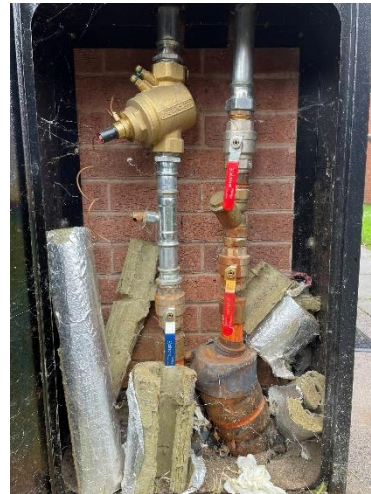
Heating Enclosure – Serving Flats 63-76

The pre-insulated pipework was installed in 2017 and appears in a suitable condition. It should be noted that the installation of the pipework does not conform to best practice and likely to not conform to manufacturers installation guidelines. This is predominantly that pipework should be buried a minimum of 400/500mm below the surface. There is evidence that the pipework has been installed shallower than this. It was also noted, on site, that recent re-paving works, uncovered the pipework sitting at 200mm below the surface. This increases heat loss of the pipework but more importantly does not provide enough cover to avoid damage from any groundworks.