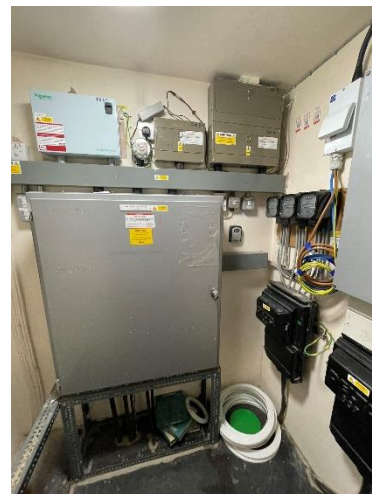
Main Landlord Board