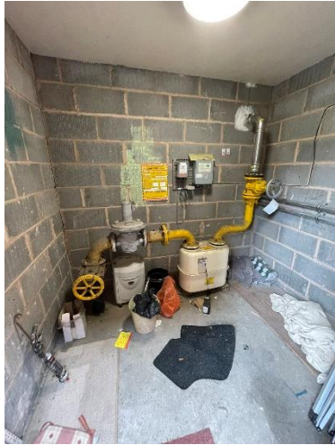
Gas Meter Room – Uninsulated Heating Pipework on Right Hand Side