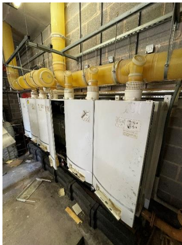
Boilers and Flues

A Magnaclean Industrial magnetic water filter and a Flamco Pro PDS 231 combined pressurisation and dosing unit are installed on the primary circuit between boilers and buffer vessel. Indication from the survey is that there is no dosing procedure as part of the FM strategy. When the system was overhauled in 2017, there are no records to determine if any chemical inhibitor was added to the system.