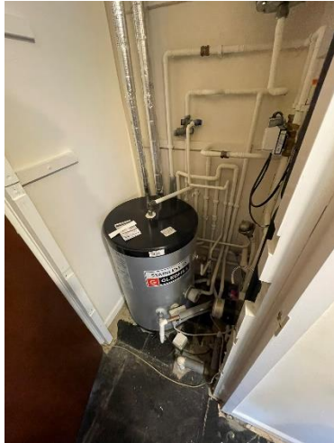
Typical Service Cupboard with Hot Water Cylinder