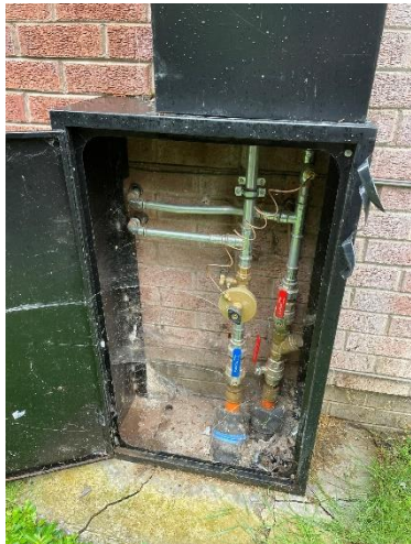
Heating Enclosure – Serving Flats 83-90