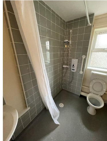
Typical Wet Room with Electric Shower

As a common theme to externally piped services, the majority of pipework within the flats is uninsulated.