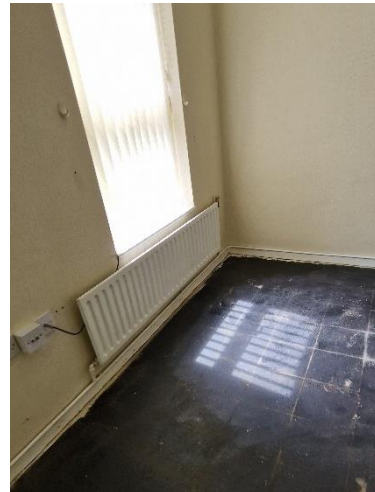
Example of Single Piped Radiator

Supplementary to the wet heating system, bathrooms are complete with electric towel rails in addition to a wet radiator. These have been recently installed and are complete with their own controls.