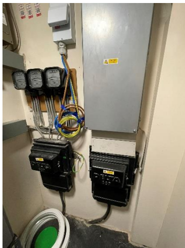
2 No. Incoming Electrical Supplies

It is understood that conversations between SKDC and National Grid have begun and so the recommendations associated with the electrical works are not included within the budget costs outlined in this report.