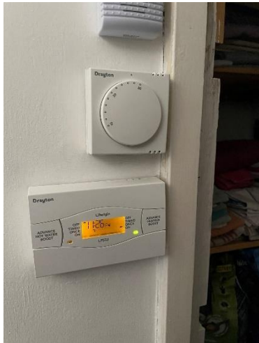
Thermostatic Controller (Set to 30°C)