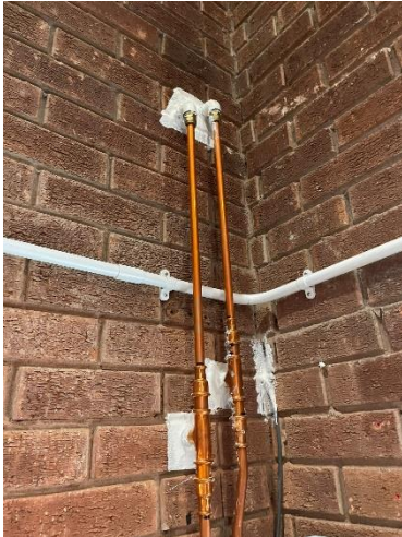
Uninsulated pipework to radiators