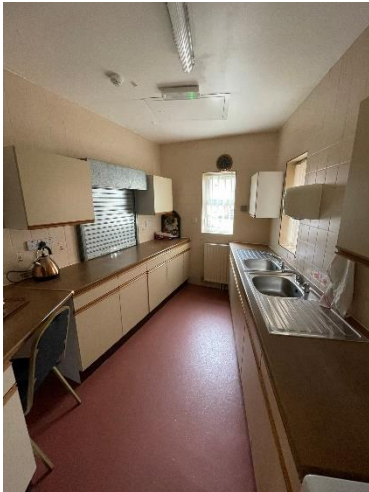
Common Room Kitchenette