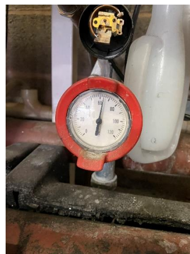
Temperature Gauges on Boilers