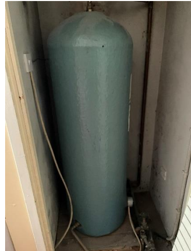
Laundry Hot Water Cylinder