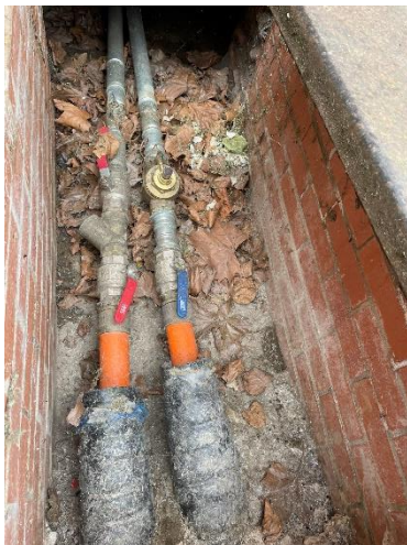
External Manhole Serving Flats 1-16